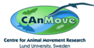
Lund University Centre for Animal Movement Reserach