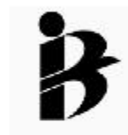
Irkutsk State University Research of Biology