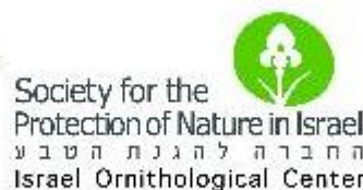
Society for the Protection of Nature in Israel חברה להגנת הטבע Israel Ornithological Center