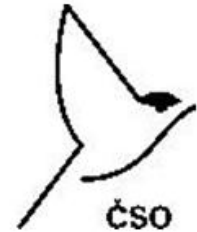
Czech Society for Ornithology