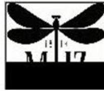
Museum & Institute of Zoology Polish Academy of Science