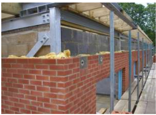
New Barnet, North London: Schwegler "Swift bricks installed in sheltered housing project

Don't allow creepers or plants to encroach on the nest. They will hinder the Swifts and give access to predators.